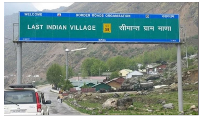
Mana village - First