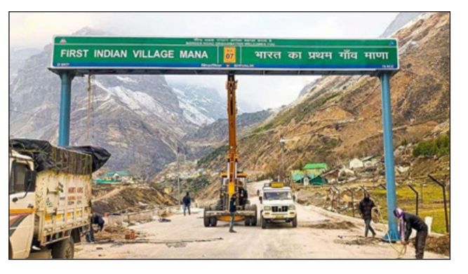
Mana village - now